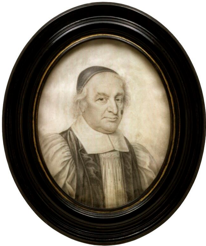
David Loggan, plumbago on vellum, circa 1684, NPG 1872, © National Portrait Gallery, London

The image below is dated c. 1684 and shows Mews with his patch.