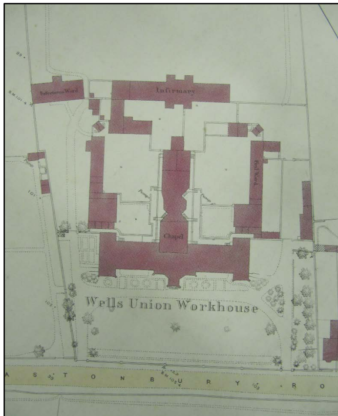
Figure 1 Wells Union Workhouse as shown on the 1886 Ordnance Survey map of Wells.

The 1536 dissolution of the monasteries, an important source of help for those in need, didn't help! The state stepped in and various Acts and laws were passed setting out how the poor and needy were to be supported and treated. These were brought together in the 1601 Poor Law Act. This laid a responsibility on the parish to: