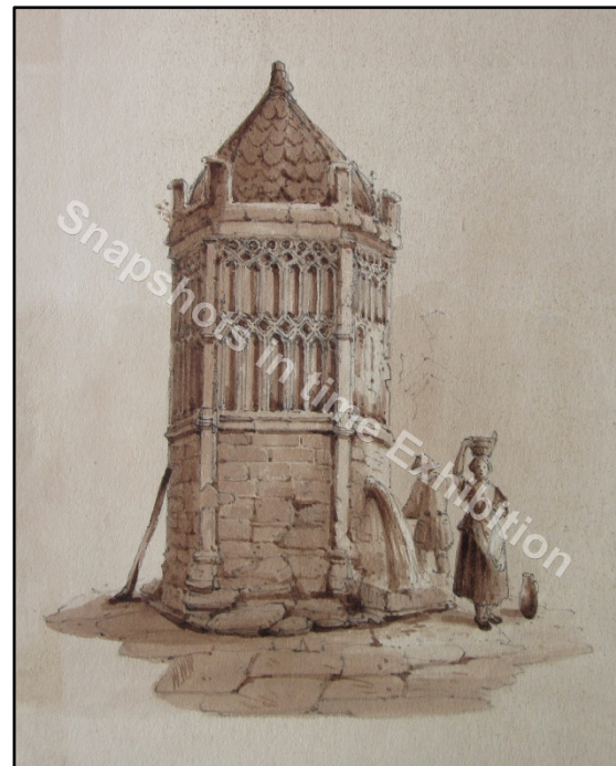
Figure 6 W.W. Wheatley, sepia watercolour & pencil drawing of old fountain at Wells, South West Heritage Centre, SANHS Illustrations Collection (SHC A\DAS/1/420/32).