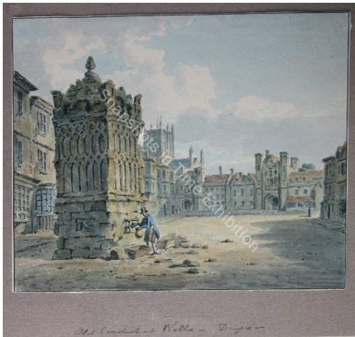
Figure 4 E Dayes, Polychrome watercolour drawing of Old Conduit Wells, endorsed 'Old Conduit at Wells, Somersetsh, now (1805) demolished - Dayes', SANHS Illustrations Collection (South West Heritage Trust) (SHC A\DAS/1/420/31)

would have been a lead-lined reservoir inside the conduit head, with an overflow from which the excess water ran into a subterranean channel [.....] (and) was conducted into one or more channels running down High Street". 4