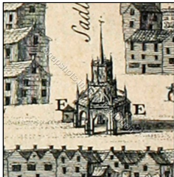
Figure 1 W. Simes, A Plan of the City of Wells, 1735.

place where the said bishop [Bishop Bekynton] is buried in the church of St Andrew to render prayers for his soul...” .