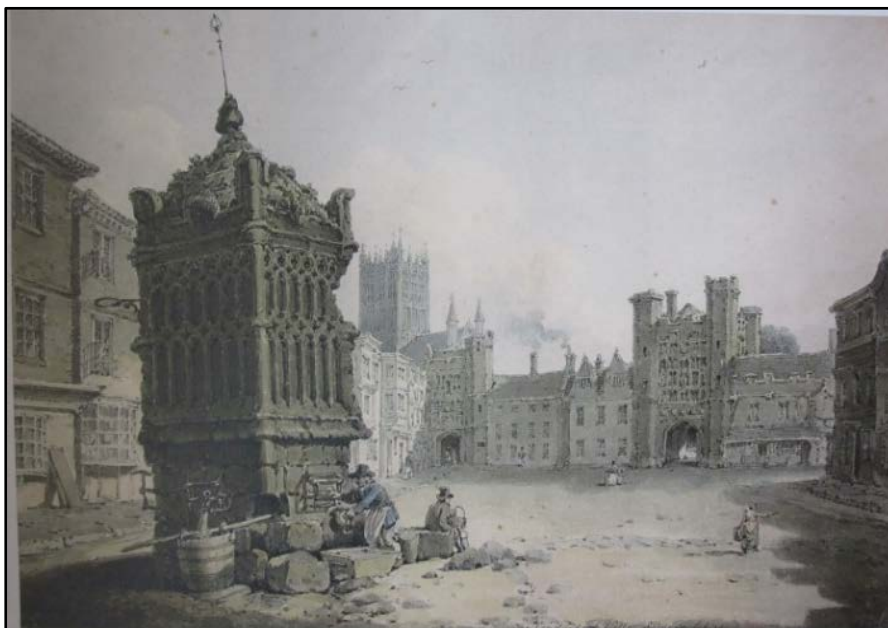
Figure 3 Original watercolour of the Old Conduit, William Alexander c. late 1700s. (The Bishop's Palace Collection)

The lower level has water outlets, on each of the visible sides, protected by a grill.